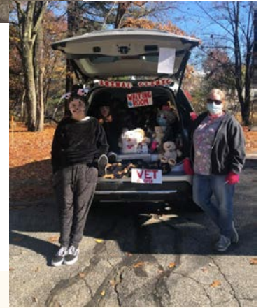
Gate City Charter School for the Arts